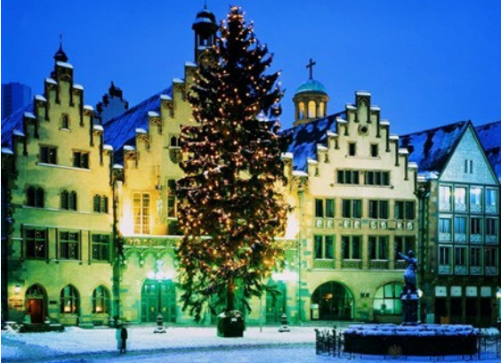
Drink a glass of gluhwein from the holiday market at the Romer, Frankfurt 's city hall since 1405 and enjoy a taste of Christmas past.