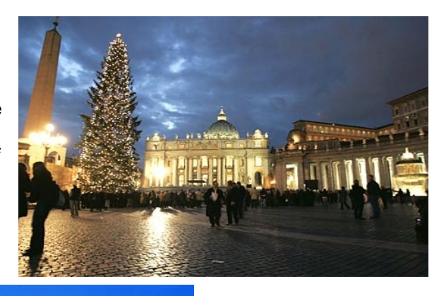
In addition to the Vatican 's heavenly evergreen, St. Peter's Square in Rome hosts a larger-than-life nativity scene in front of the obelisk.

Against a backdrop of tall, shadowy firs, a rainbow trio of Christmas trees lights up the night (location unknown).