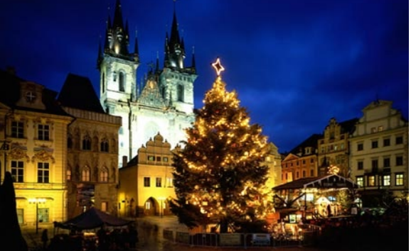
Illuminating the Gothic facades of Prague's Old Town Square, and casting its glow over the manger display of the famous Christmas market, is a grand tree cut in the Sumava mountains in the southern Czech Republic.